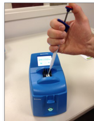
Positive Displacement Pipette